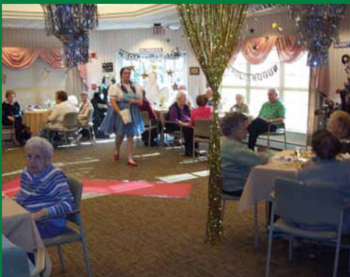
The room was set up night club style. Each Hollywood character passed out theme based goodies to every resident