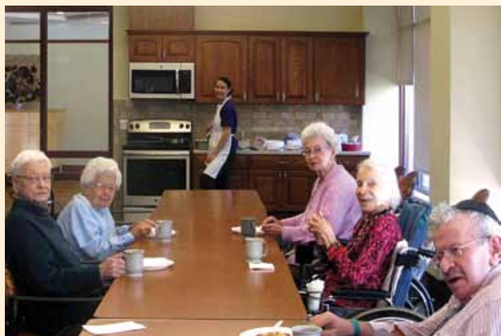
Residents enjoying the new Activity Center kitchen.

We are proud of the new kitchen as it enhances the day to day lives of our residents and offers an added dimension to the quality of life and therapeutic services enjoyed by them.